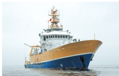
Research vessel Coriolis II, ISMER