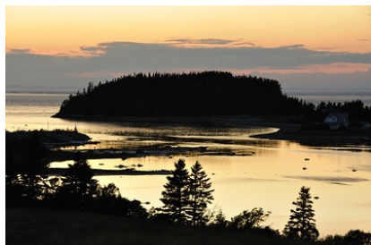
Parc national du Bic, Guillaume Cattiaux